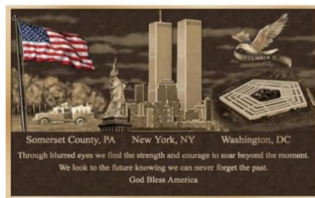
Maine American Legion – Post 1390 Remembering 9/11