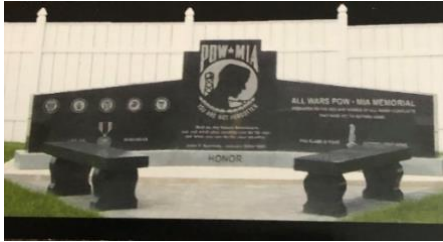
American Legion – George F. Johnson Post 1700 - Veterans Memorial