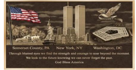
Maine American Legion Post 1390 Remembering 9/11