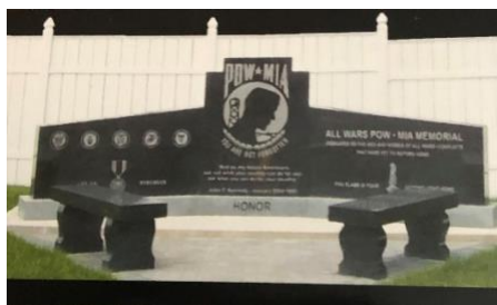
American Legion - George F Johnson Post 1700 - Veterans Memorial